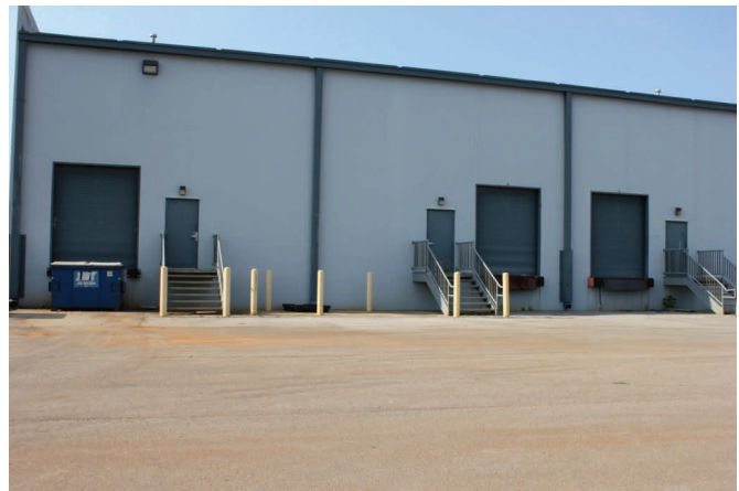
Dock high doors