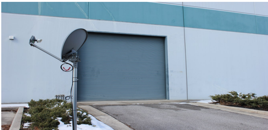
Drive-In Door on East Side of Premises