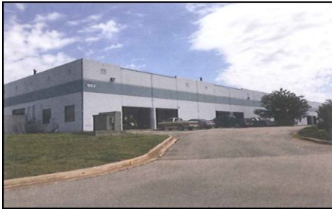
Located in the Center of Huntsville's Growth Corridor