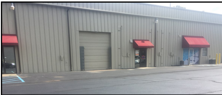
Located in the Center of Huntsville's Growth Corridor